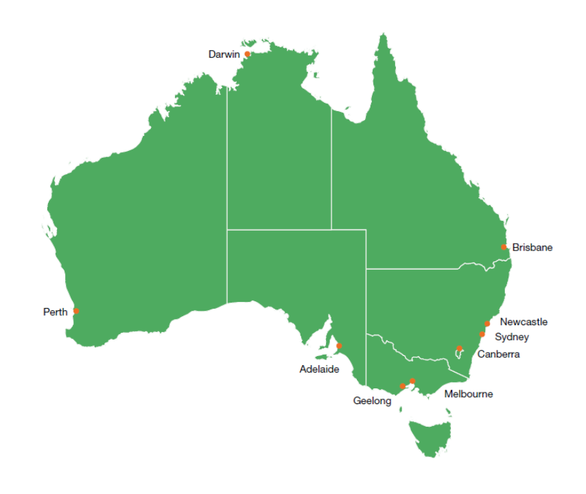
Map: Tetra Tech Coffey Australia office locations

Tetra Tech International Development and Norman Disney & Young have already begun their reconciliation journeys, establishing Reflect RAPs in 2018 and 2020 respectively. Both companies are now implementing their Innovate RAP's.